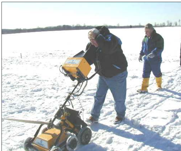
Surface-penetrating radar equipment can even be used when the ground is frozen.

Malvern, he realized that they could trap the British against the flooding Schuylkill River and perhaps, annihilate them. But his message to Washington, who had already crossed the Schuylkill, was intercepted enabling British General William Howe to attack Wayne at night before Wayne's forces were ready. The resulting fight was called alternately, the Battle of Paoli or the Paoli Massacre.