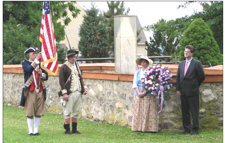
The loss of Continental forces is commemorated annually at the burial site in the Paoli Memorial Grounds.

In a battlefield setting, such investigations can find clusters of musket balls revealing lines of fire. Repeated use of metal detectors and the revealing profiles from surface penetrating radar uncover hard data on the actual battle instead of relying on anecdotal accounts from participants.