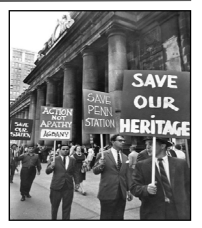
Grand Central Station 1962

Charleston SC adopted the first preservation zoning ordinance in the country in 1931. Now 2,300 U.S. communities (over 35 in South Carolina) have adopted preservation ordinances. The U.S. Supreme Court upheld their constitutionality in the Penn Central Transportation Co. v. City of New York (1978) case.