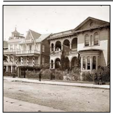
Charleston circa 1931

If there is a preservationist you would like to have included in "In Memoriam," please send the details to ledger.editor@comcast.net.