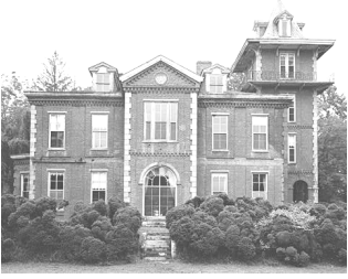
Cedarcroft, East Marlborough Township, 1859