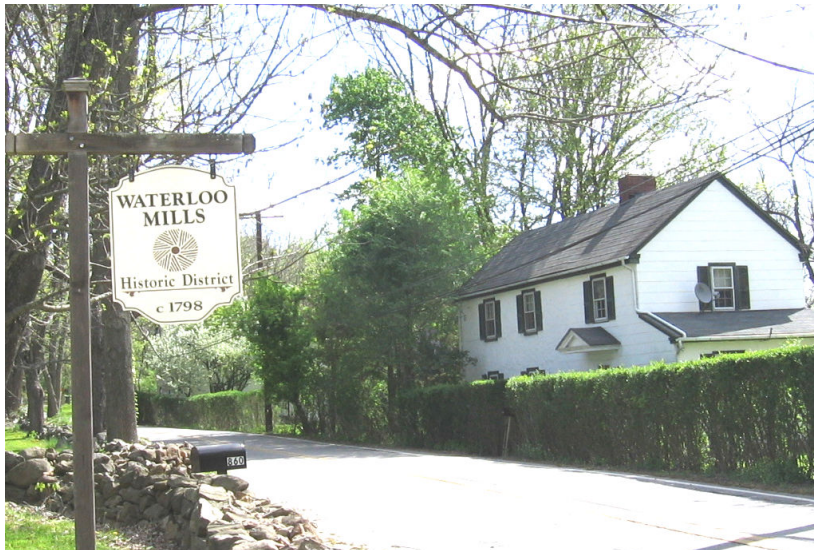
The Historic District and 190 acres are owned and managed by the Brandywine Conservancy.