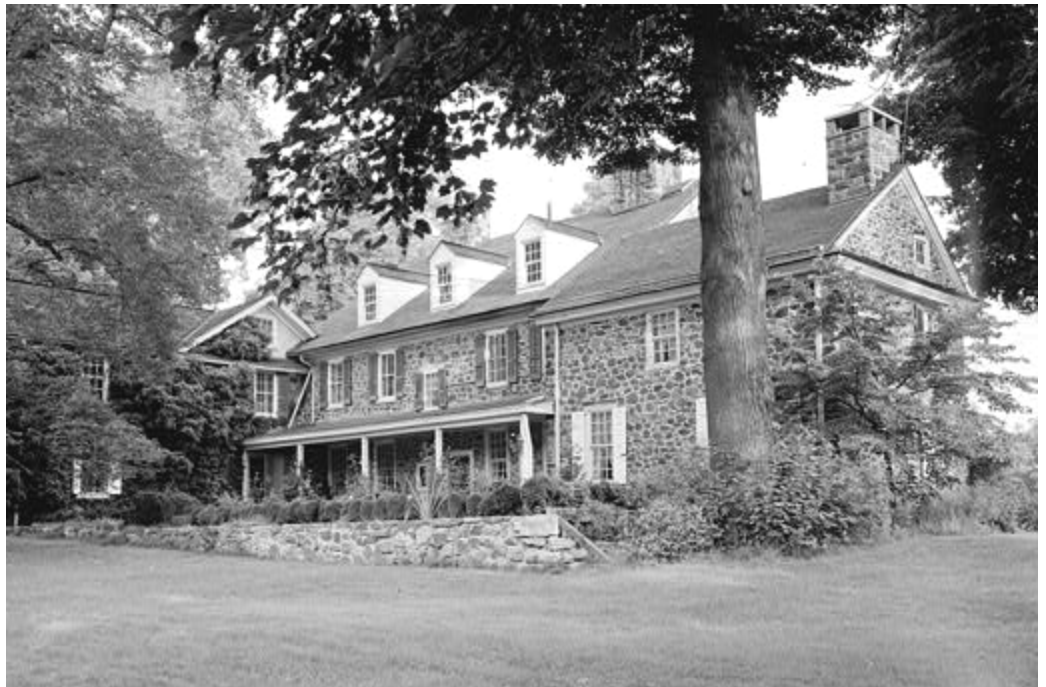
Historic Waynesborough was initially built in 1724 with subsequent construction in 1735, 1790, 1853, 1902, and 1965.

Philadelphia was occupied by the British and Washington made his winter encampment at Valley Forge, Chester County became a hotbed of conflict. American forces, including the county militia, harassed British foraging parties forcing them to conduct supply expeditions using thousands of troops. The hostility of the surrounding countryside was one of the factors which led the British to abandon their occupation of Philadelphia the following summer.