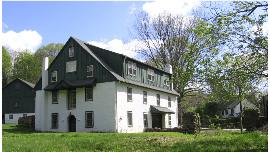
The grist mill and most of the other buildings in the district, are used as residences. The preserve manager lives here.

Darby Creek. It is natural that the development of the various entities making up the village – the farm, mill and wheelwright/blacksmith operation, occurred roughly in the same time period, for they relied heavily upon one another. Their juxtaposition along what would