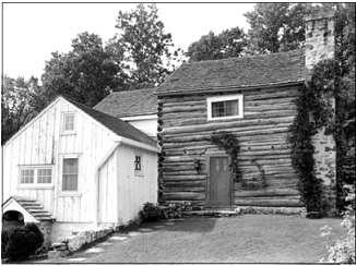
John Jacobs House, 1767, East Whiteland Township