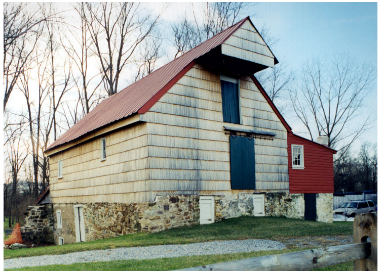
Thomas Mill, 1744, after award-winning exterior rehabilitation

Although it can take time, money, and a lot of work, a number of diligent Chester Countians have added the distinction and protection of the National Register of Historic Places to their historic properties. Notable among the list provided below are the determination of eligibility for the London Grove Township Agricultural Historic District and the re-listing of the Thomas Mill and Miller’s House following the relocation of the house and the exterior rehabilitation of both. In 2004, the following properties have been listed or determined eligible for listing in the Register. Good job to all who work so hard to protect the historic resources of Chester County!