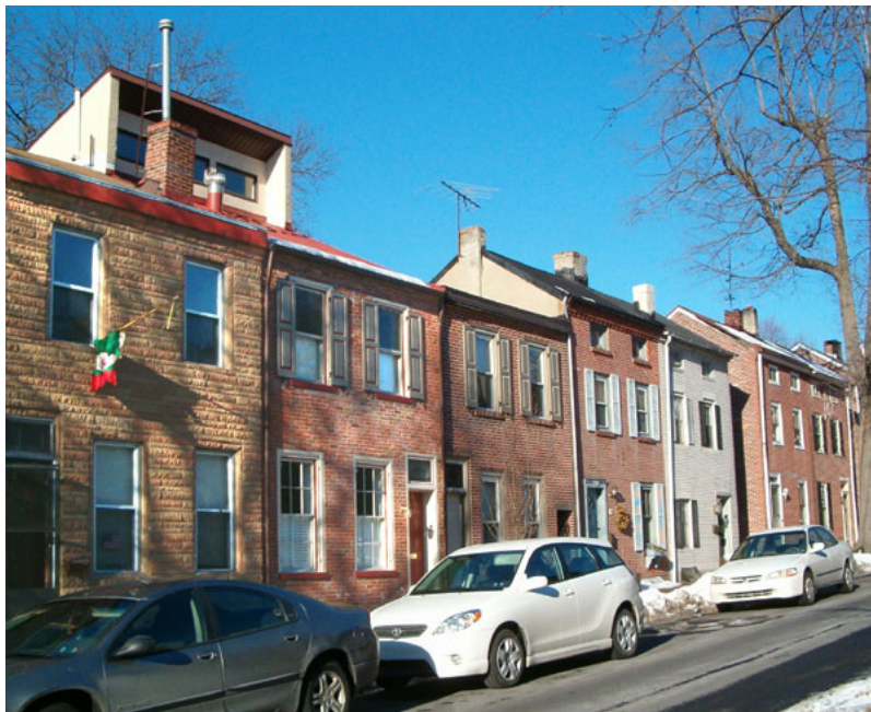
Funding from the Elm Street program will aid neighborhoods adjacent to downtown West Chester.